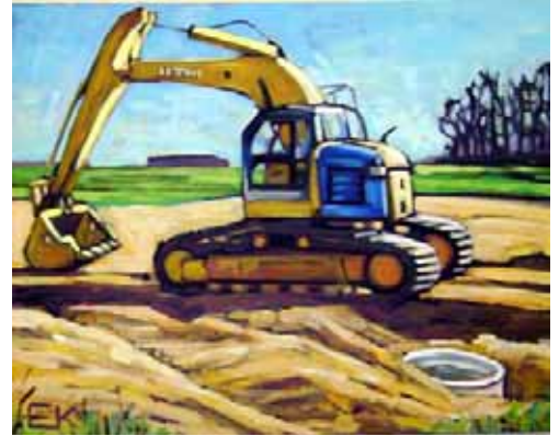
Paintings by Ed King

The Arts Center In Orange is not a luxury vehicle.